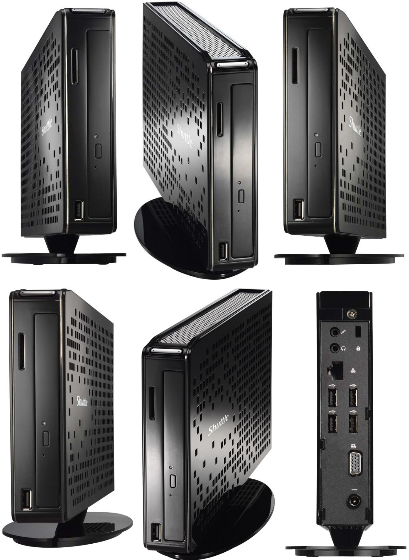
Images are only for illustration purposes. The optical drive is not included.

©2011 by Shuttle Computer Handels GmbH (Germany). All information subject to change without notice. Pictures for illustration purposes only.